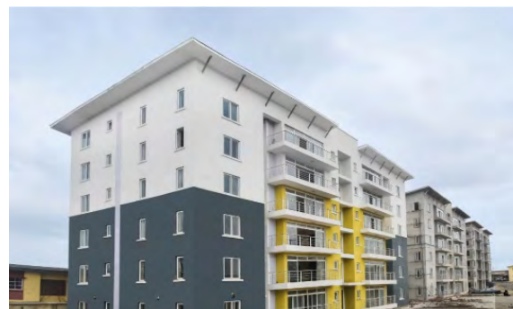
3D PLAN + ON GOING FRONT VIEW + ELEVATOR