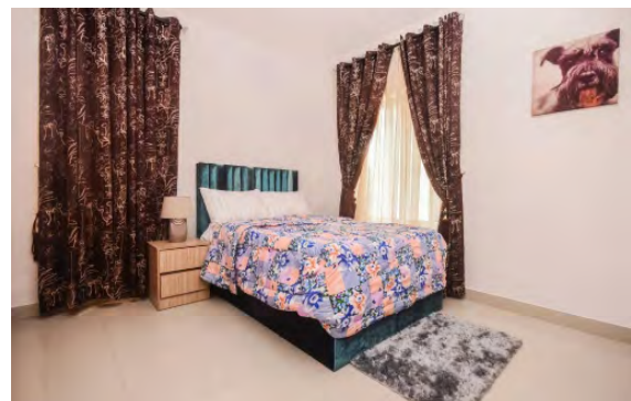
MASTER BEDROOM(ENSUITE) + KICTHEN